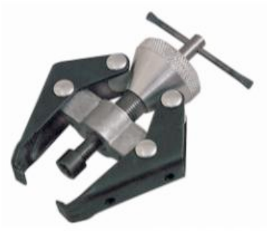
Arm puller. It's used to force screws loose.